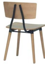
Back view chair with steel frame